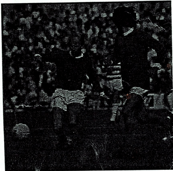
The Zippers In Action. Possibly

The IONA Zippers are back on the warpath. Having spent the winter being too soft to play in the cold evenings, our heroic representatives on the football field have already started their summer campaign with an impressive 0-0 draw with the mighty IBM (Oldbrook).